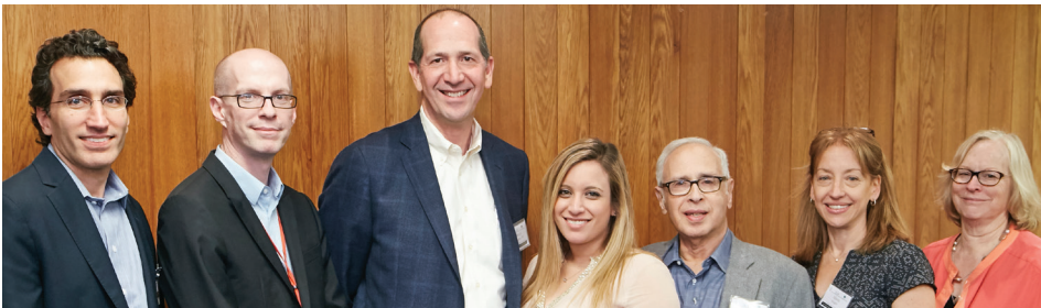
19th Annual Advances in Autism Conference Speakers

In 2016 we are celebrating the 20th Annual Advances in Autism Conference – stay tuned for more information!